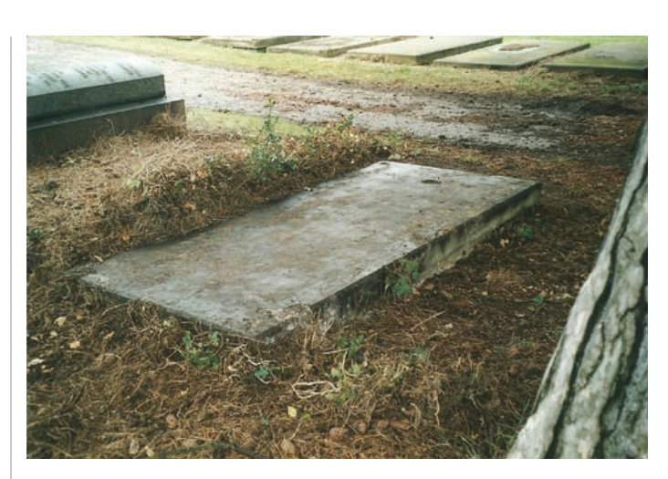
Ottaway's rather unsalubrious resting place, Paddington.

One may suggest that the multi-million pound extravaganza that is the modern English game of association football owes its first international captain a good deal more in the way of recognition.