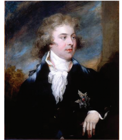
Portrait of The Prince of Wales, later King George IV (1762 - 1830) 1790. John Russell RA.

House was unusual in that the visitor entered the house on the main floor. (Most London mansions and palaces of the time followed the Palladian architectural concept of a low ground floor (or rustic) with the principal floor above.) From the foyer, the visitor entered the two storey top lit entrance hall that was decorated with Ionic columns of yellow marble scagliola. Beyond the hall was an octagonal room that was also top lit. The octagonal room was flanked on the right by the Grand Staircase and on the left by a courtyard, while straight ahead