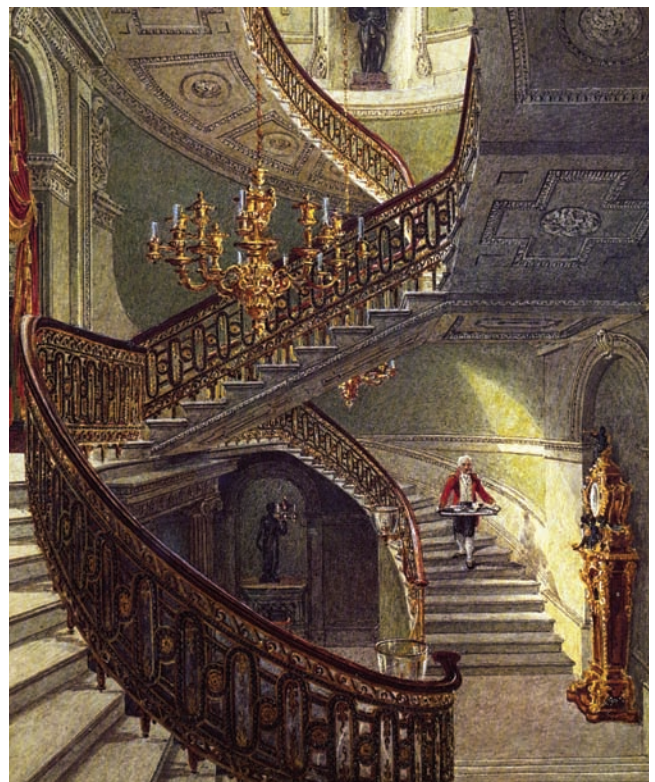
The Grand Staircase.